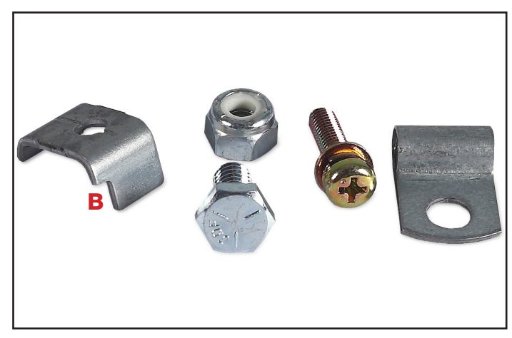
2. Note that the new cable clamp has a square notch (B).