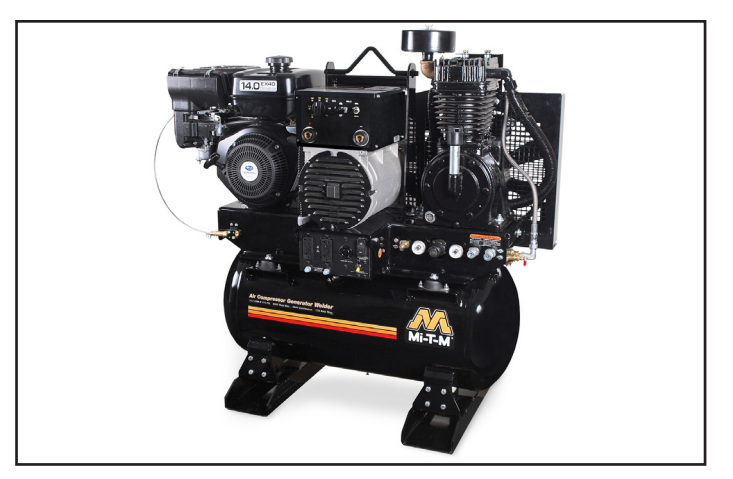
6. Test the operation of the unit with the throttle cable adjusted. If the cable is correctly adjusted the engine should throttle down to approximately 2800 RPM with no-load on the generator and the idle down switch in the auto idle down mode. When a load is applied the engine will automatically throttle back up to full throttle.