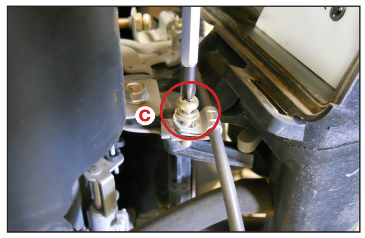
3. Remove the phillips head screw (C) holding the original cable clamp. Save the screw and washer to be used with the new cable clamp (B).