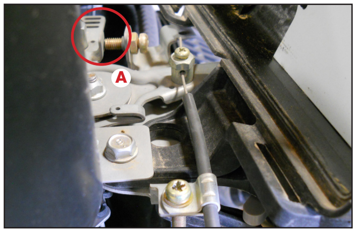
1. Note that the throttle lever stop tab is butted up against the throttle lever stop screw (A).